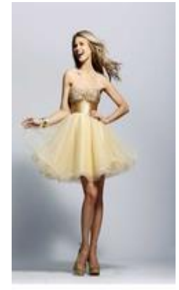
Needs Shoulder Straps Too Short/Needs Straps