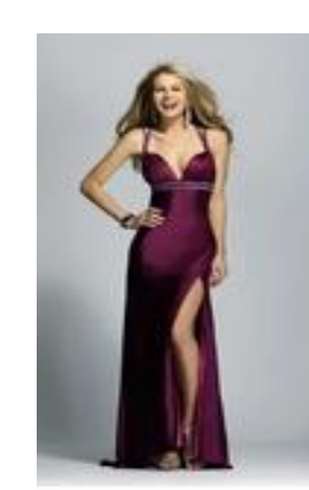
Slit too High/Too Low Cut