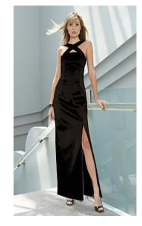
Slit to High