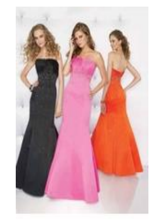
(would be ok if straps Could be too low were added)